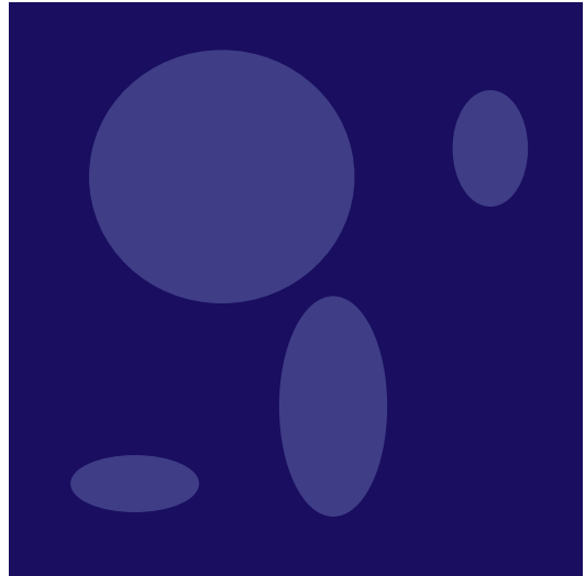
Pantone 2715 C over Pantone 275 C at 40% transparency to provide adequate contrast with light text.